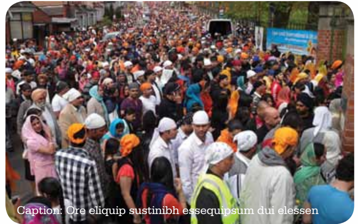
Caption: Ore eliquip sustinibh essequipsum dui elessen